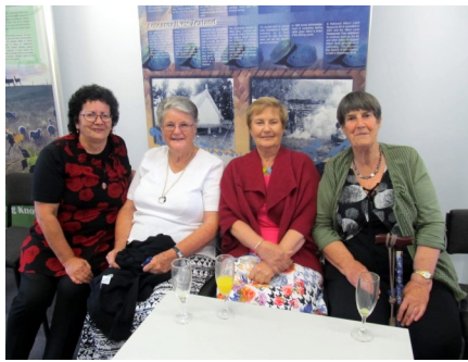
Four lovely ladies who have been great friends of Strive Rehabilitation @ Hawke's Bay/Stewart Centre @ EIT for years