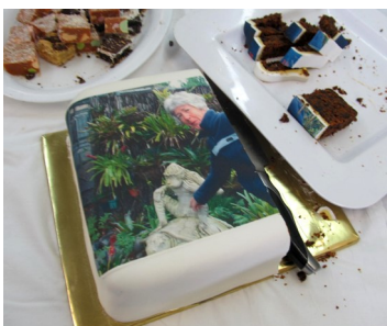
Half eaten cake but you still get an idea how good it looks