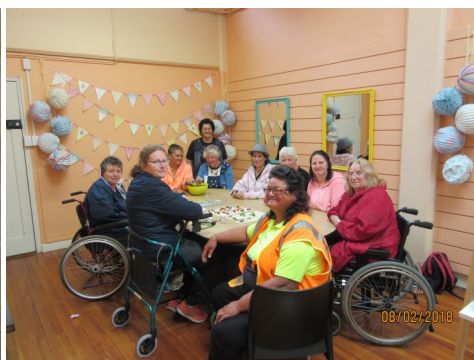
Designing the necklace in St Beads